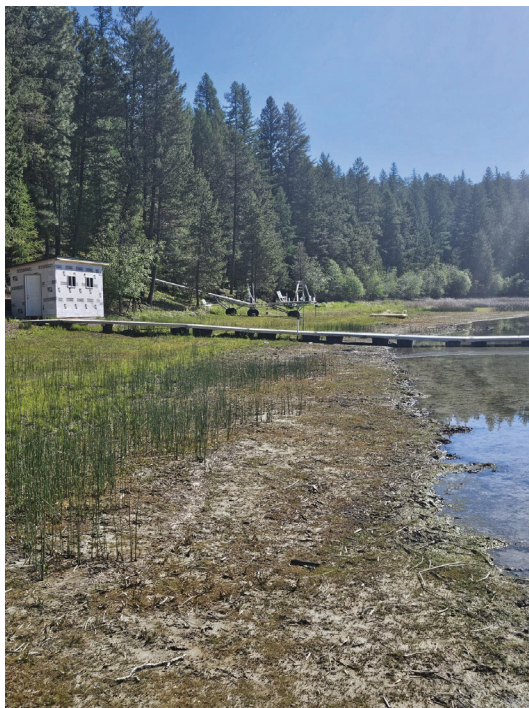
Construction in Lakeshore Protection Zone