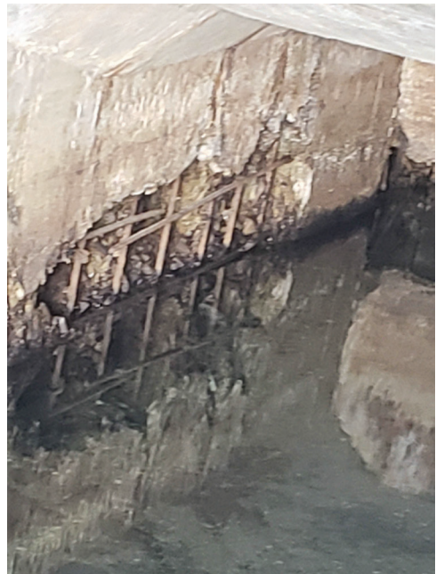
Dam West Wall – Poor Condition