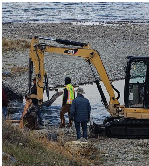
Flathead Indian Irrigation Project "Illegal" Backhoe/Work