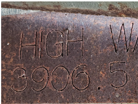
High Water Mark inside Dam 3906.5 ft. Above Sea Level