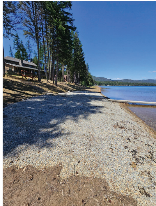
Wetlands (LOON Nesting) Destruction