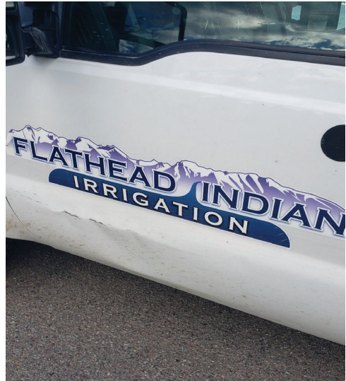
Flathead Indian Irrigation Project